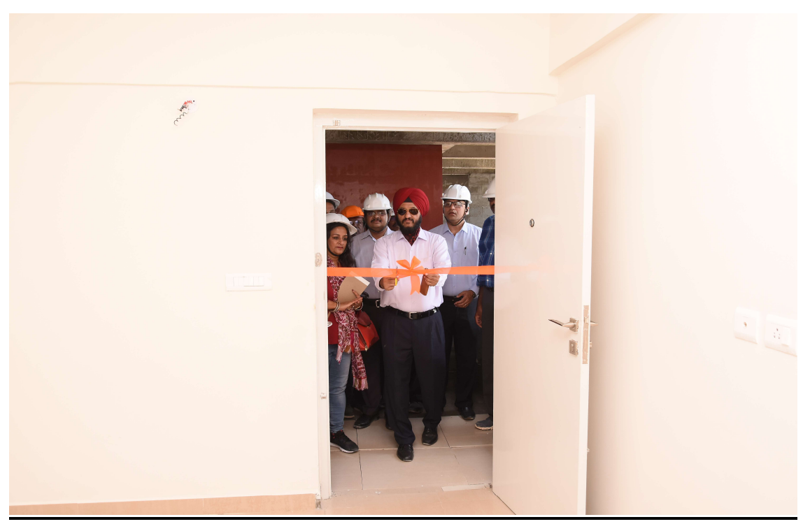
Inauguration of Model Flat 'B' Type by CEO, CGEWHO