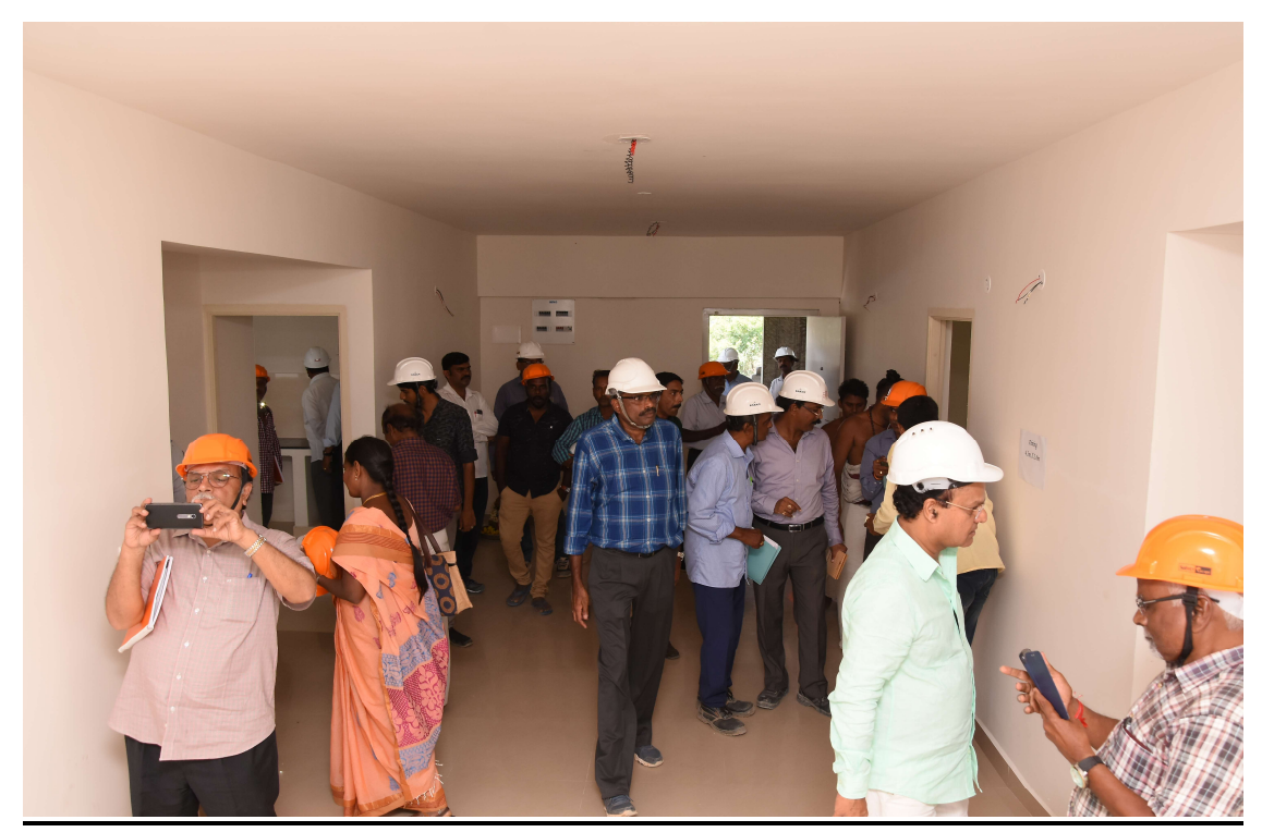
PMC Members & Beneficiaries vising Type 'C' Model Flat