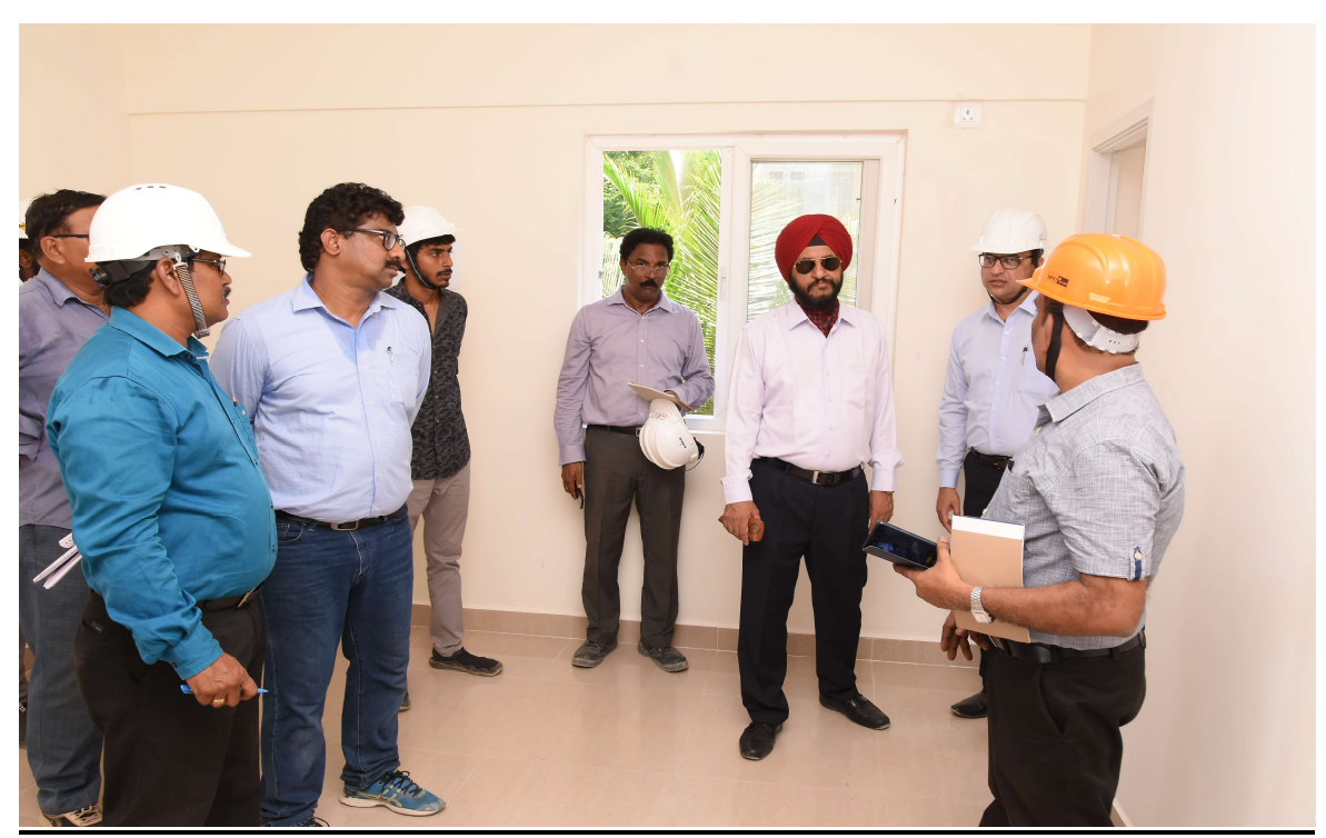
PMC Members Discussions with CEO, CGEWHO