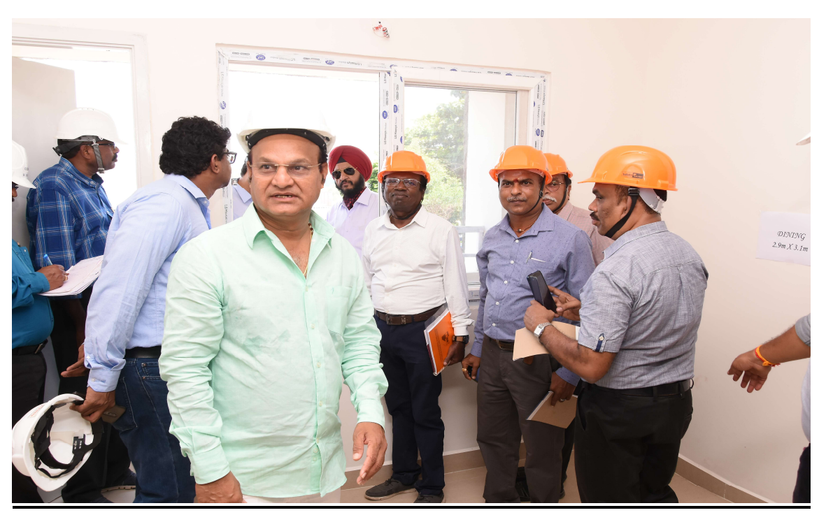
PMC Members & Beneficiaries vising Type 'B' Model Flat