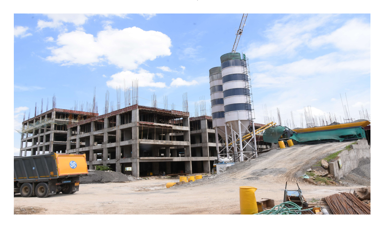
View of C1, C2 & C3 Block from B Block