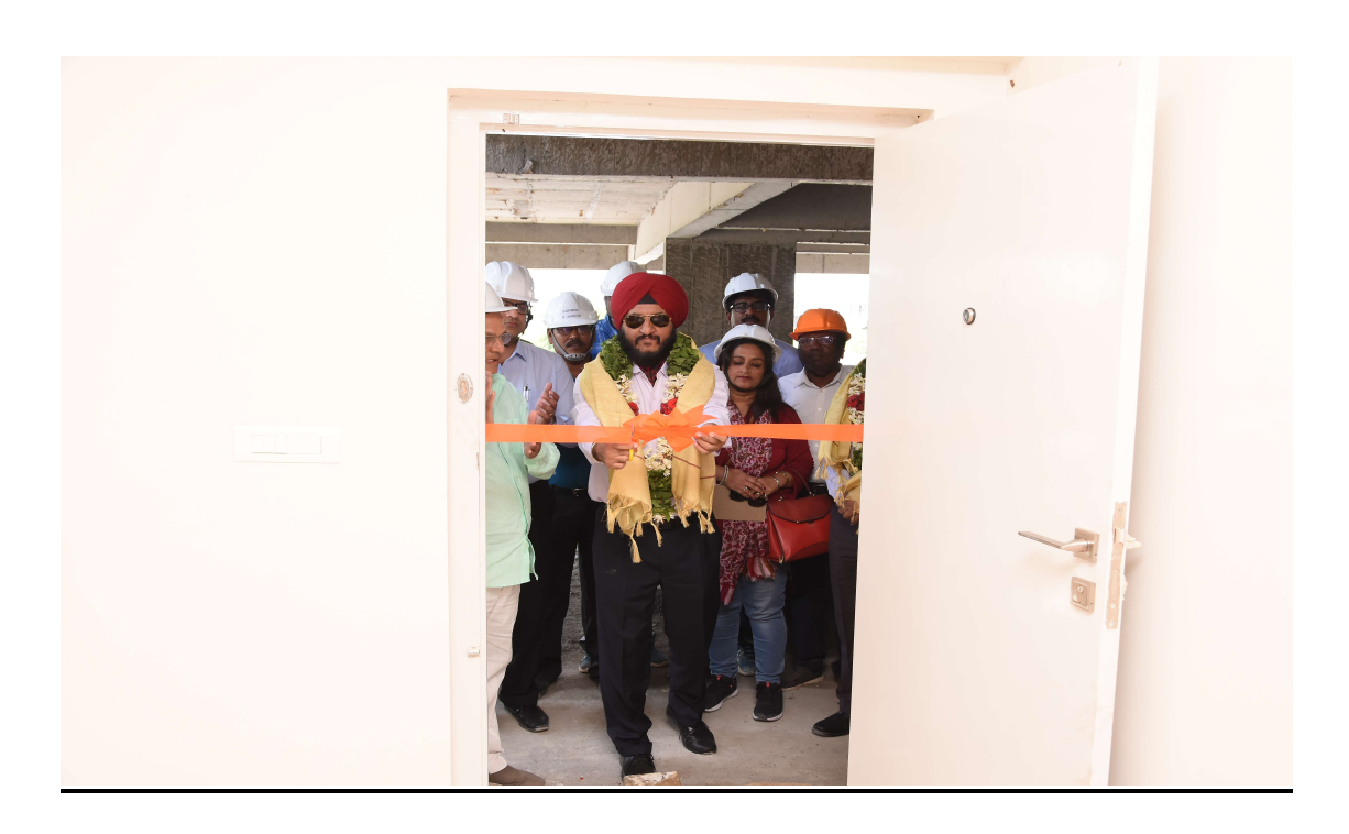
Inauguration of Model Flat 'C' Type by CEO, CGEWHO