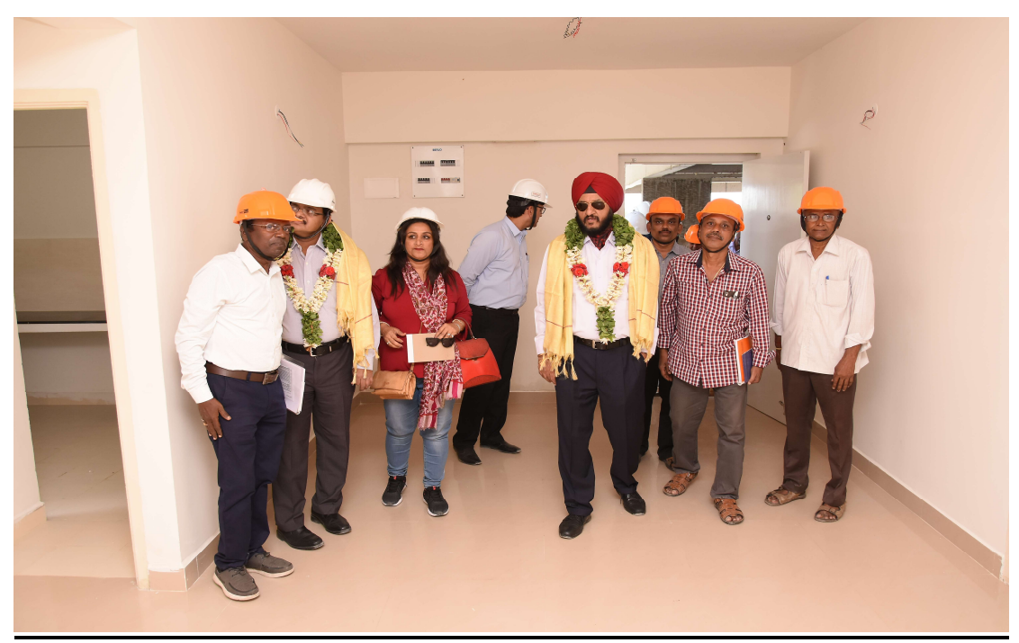
PMC Members & Other Beneficiaries With CEO, CGEWHO & Jt.Secretary, M/o HUA