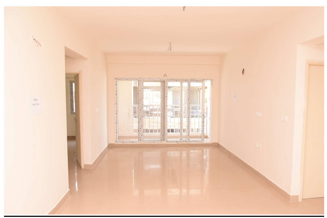
Entrance View of Type 'C' Model Flat