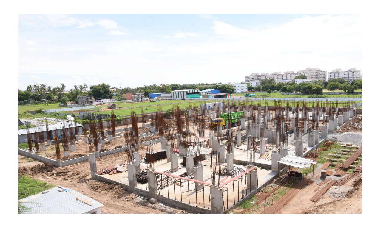
View of A1 & A2 Block from B Block