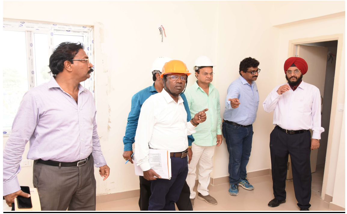
PMC Members Discussions with CEO, CGEWHO